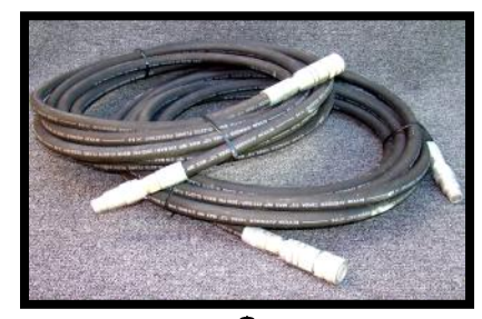
595.00 1/2 In. Hydraulic Hose Set 50 Ft.